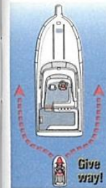
Power vs. Power