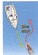
Power vs. Sail

Power vs. Sail: The powerboat is the give-way vessel. The sailboat is the stand-on vessel.