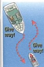
Power vs. Power