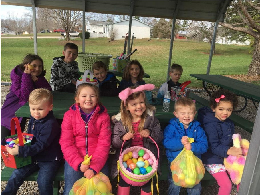
The participants showing off their finds!

Even our recent Easter Egg hunt was affected by our unpredictable Spring weather, with a week's delay because no one thought the kids would be able to find the eggs in the snow! Although it was delayed, everyone seemed to have a great time!