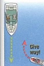
Power vs. Power