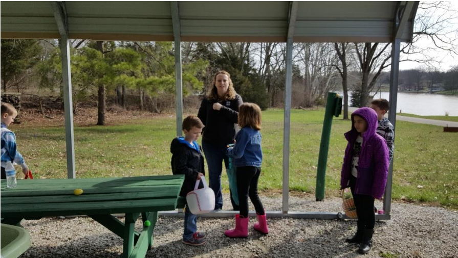
The heart of the hunt!!