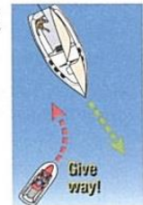
Power vs. Sail

Power vs. Sail: The powerboat is the give-way vessel. The sailboat is the stand-on vessel.