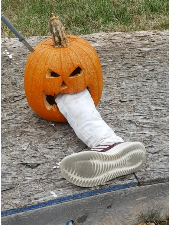
Halloween decorations in front of the Trotters' Schaefer Lake home.